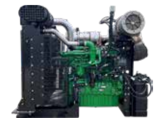
Custom Power Units (5-908 hp)