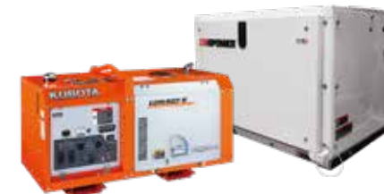
Portable Generators • Kubota GL Series (7-14 kW) • CK Power Portable Generators (7 kW)