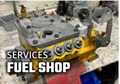
SERVICES FUEL SHOP

Precision in-house machining for heavy-duty diesel engines including crankshafts, engine blocks, cylinder heads, and connecting rods.