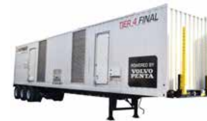
CK Power Containerized Generators (500-1250 kW)