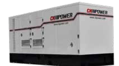
CK Power Stationary Generators (12-1250 kW)