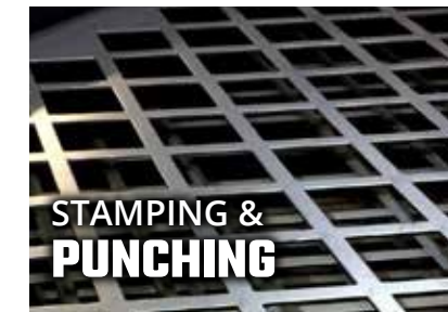
STAMPING & PUNCHING

Precision milling, turning, and fourth-axis machining for seamless component integration.