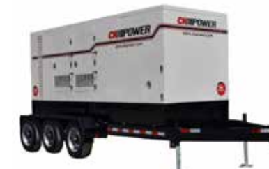
CK Power Mobile Generators (12-1250 kW)