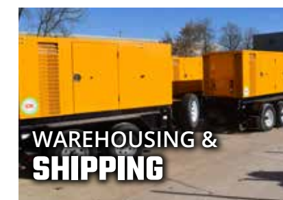
WAREHOUSING & SHIPPING

Dedicated space for assembling everything from simple components to full product builds.