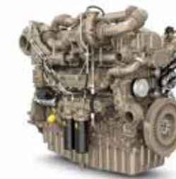
John Deere Engines (74-908 hp)