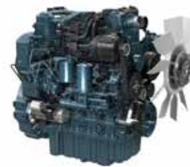
Kubota Engines (13.3-215 hp)