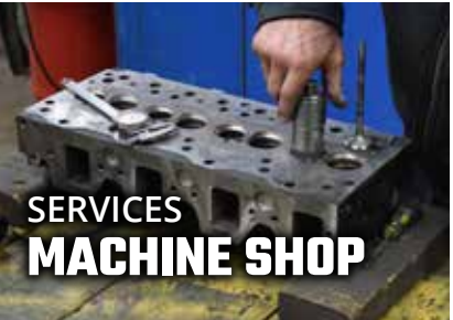
SERVICES MACHINE SHOP

Maintenance, load bank testing, and engine rebuilding.