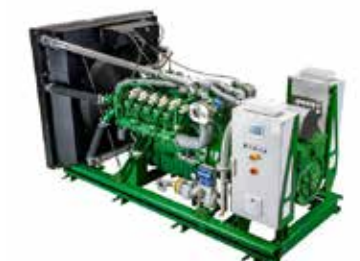
2G by CK Power Demand Response Generators (620-1000 kW)