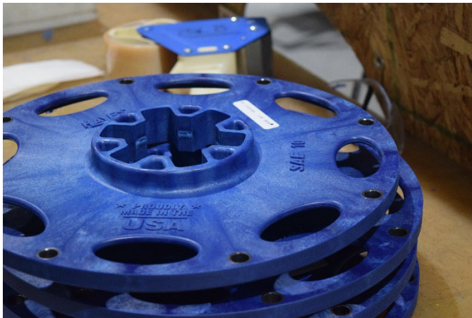
Photo Caption 4 : Hayes Manufacturing's world-renowned original flywheel coupling providing smooth power transfer for utility equipment.