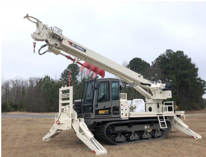
Photo Caption 2 : Terramac rubber tracked carrier with Terex 6060 digger derrick attachment.