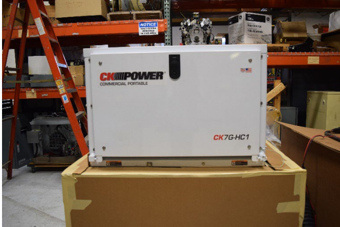
Photo Caption 3 : CK Power CK7G-HC1, 7kW portable power generator for mounting to utility vehicles.