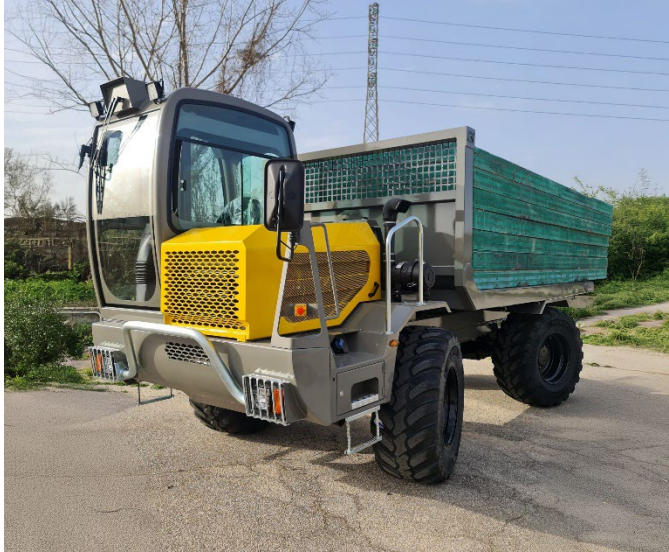
Photo Caption 1 : Terramac D14 Wheeled Dumper outfitted with a flat bed.